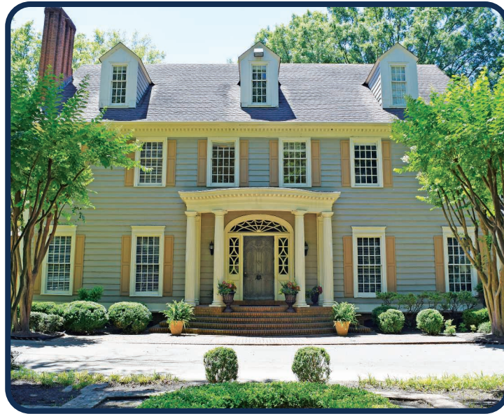
GMF's Stephen Olford Center